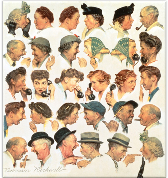
Norman Rockwell (1894-1978), "The Gossips," 1948. Painting for "The Saturday Evening Post" cover, March 6, 1948. Oil on canvas. Private collection.

Celebrity Gossip: Colorful gossip about people who are well known. Usually shocking and the most interesting. It is likely everyone knows anyway so you cannot possibly be blamed for spreading it!